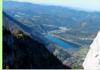
Lunz am See