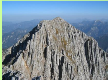
Vorbei am Lugauer